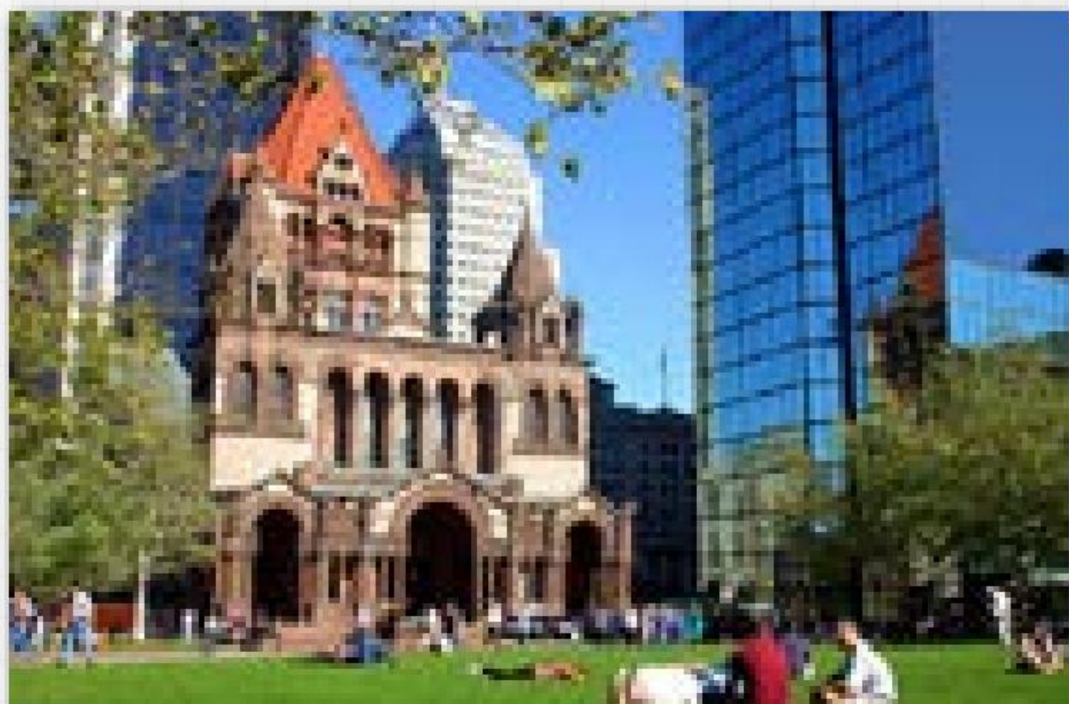
The Philadelphia Zoo