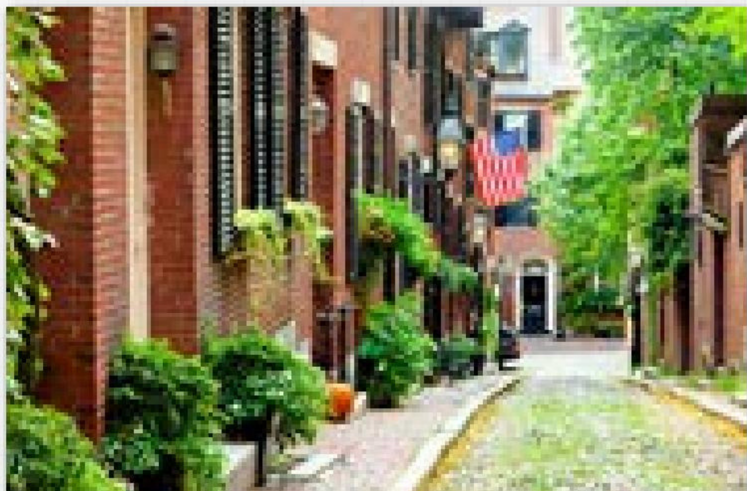
Parks & Gardens