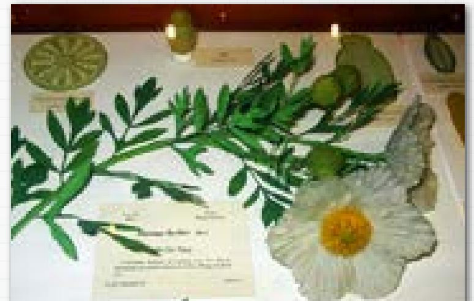
Transfer & Transport