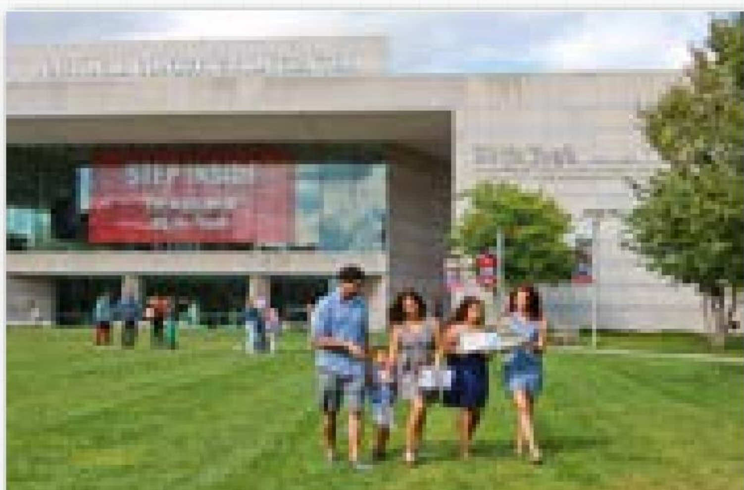
Philadelphia Museum of Art