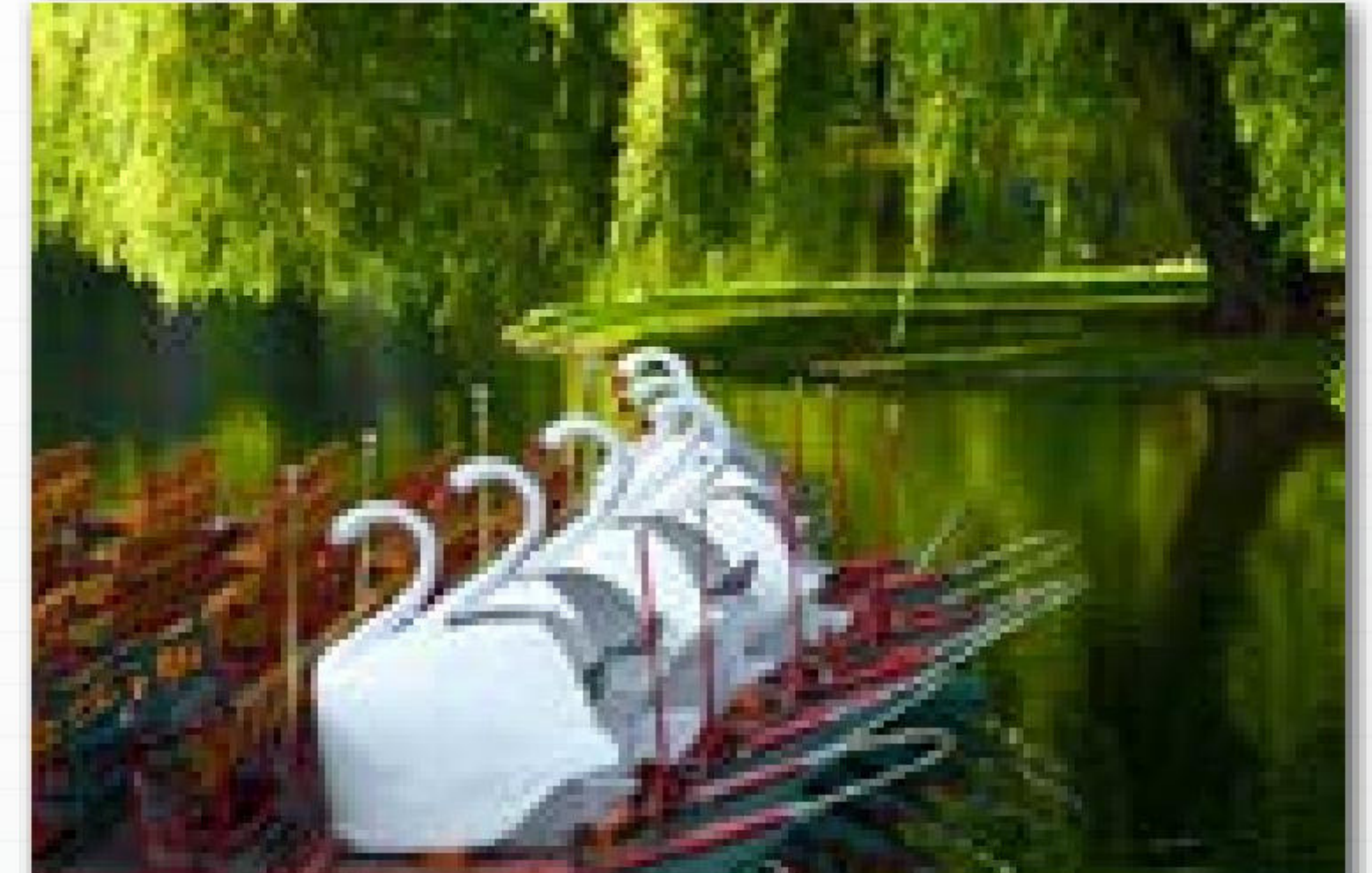
Day Tours and trips