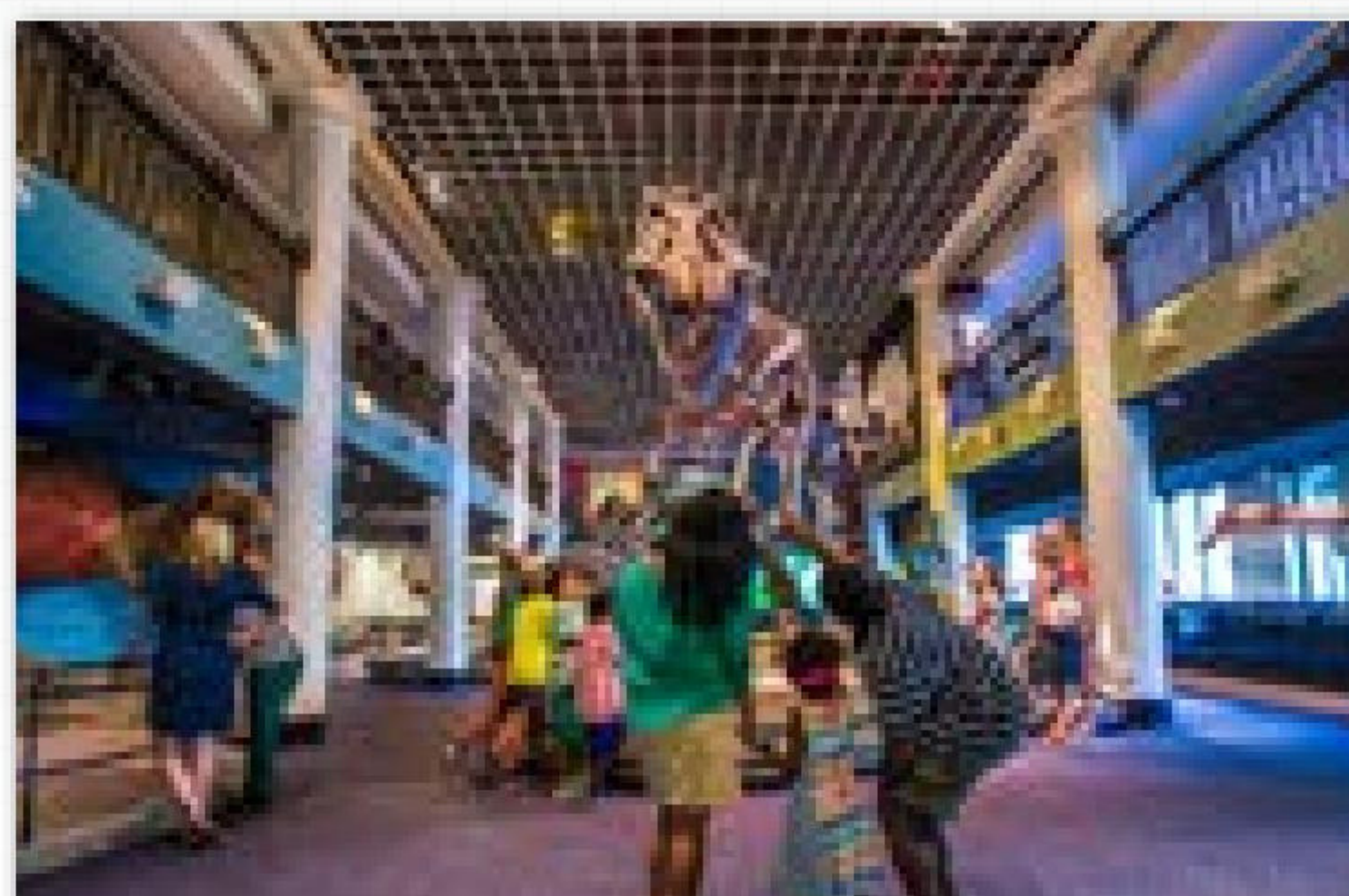
Academy of Natural Sciences of Drexel University