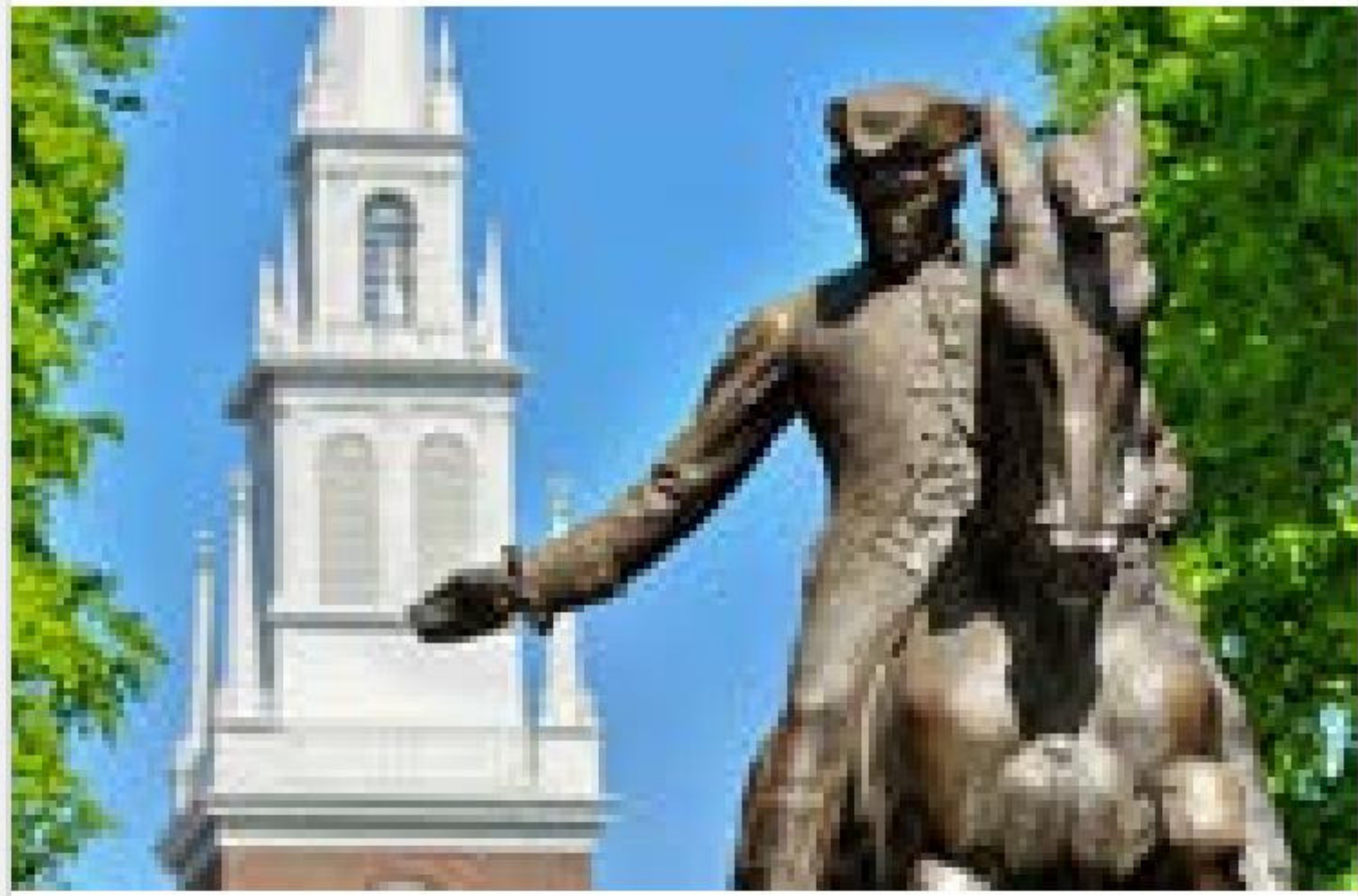
Popular Things To Do in Vancouver