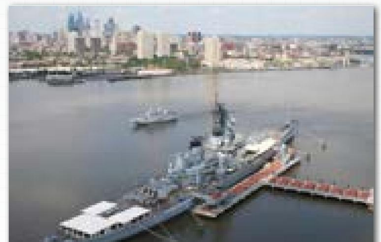
Battleship New Jersey