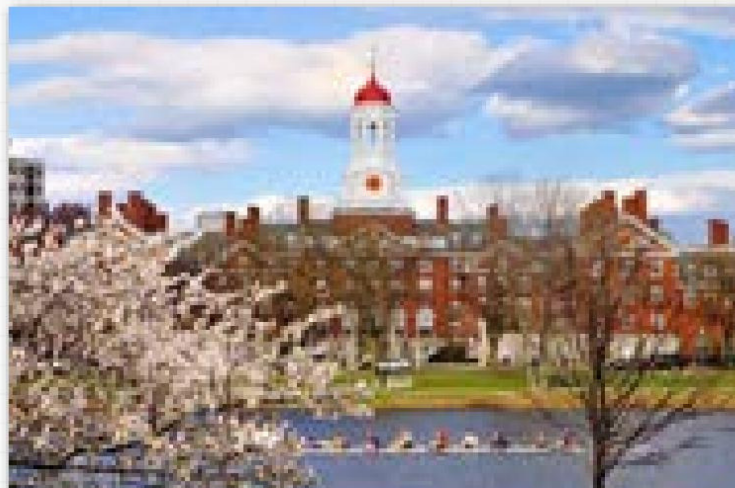
Out Door Activities